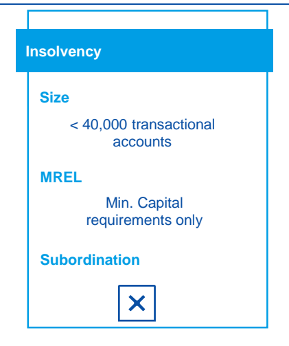
Figure 1 MREL Calibration in the UK